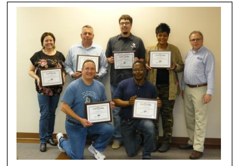
MAY 2018 GRADUATES