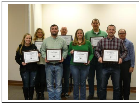
MARCH 2018 GRADUATES