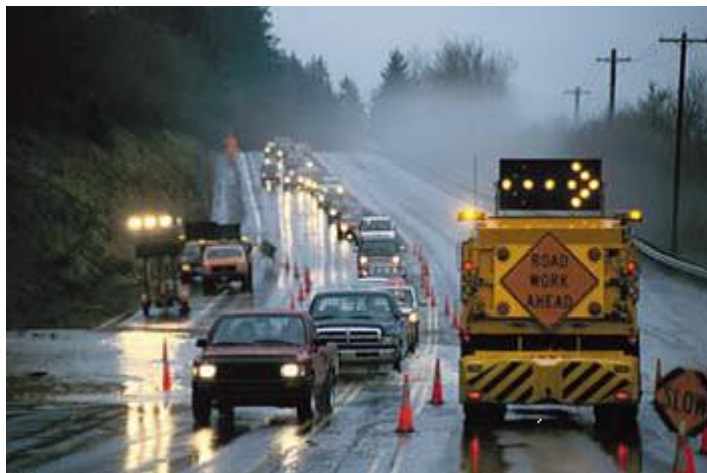
Objects and vehicles striking workers are the leading cause of roadside-related construction deaths.

The annual National Work Zone Awareness Week , April 9-13, features events across the country to bring attention to these hazards and encourage safe driving around work zones. The Georgia Struck-By Alliance , which includes OSHA, will hold stand-downs at highway construction locations throughout Georgia during the week to train workers on the dangers of distracted driving and flying debris. More than 140 workers were fatally injured in crashes at roadway worksites in 2016.