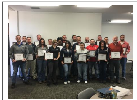
MARCH 2018 WHIRLPOOL GRADUATES