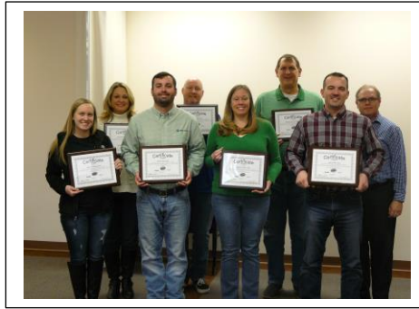
MARCH 2018 GRADUATES