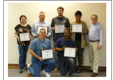
MAY 2018 GRADUATES