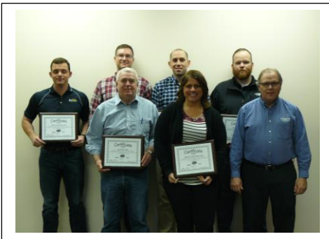
FEBRUARY 2018 GRADUATES

The Safety Council of Northwest Ohio is proud to announce our graduates for the curriculum-based COSS in the first half of 2018: