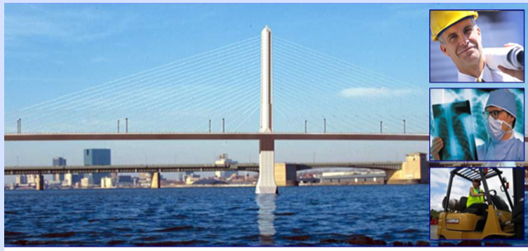
Northwest Ohio Safety and Health Day

What a success! The hallways were a little cramped at times, but with 385 attendees that is to be expected. Attendees took advantage of the FREE safety and health trainings throughout the day and had the opportunity to visit with several vendors for their safety needs.